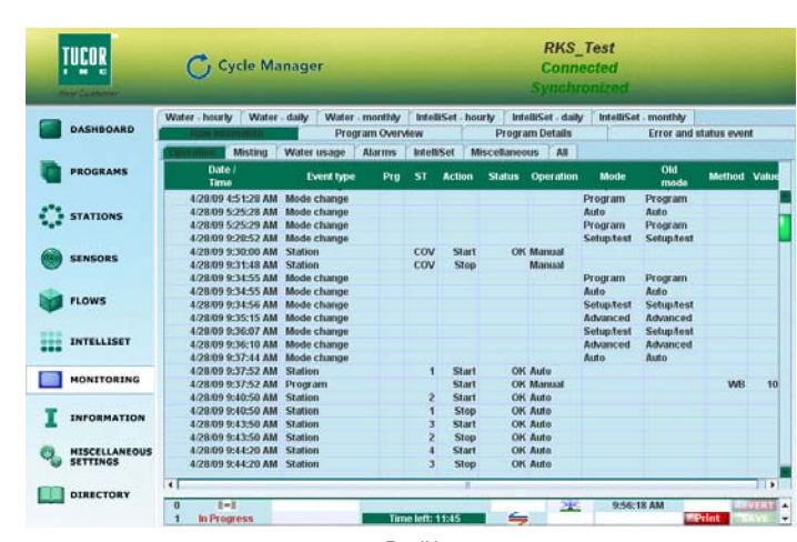
RealNet Monitoring Data